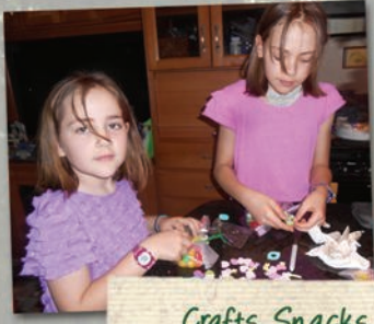
Crafts, Snacks, and Dramas

Please pray with us as we search for a place to rent.