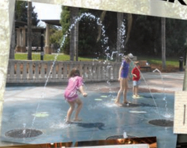
Having fun together